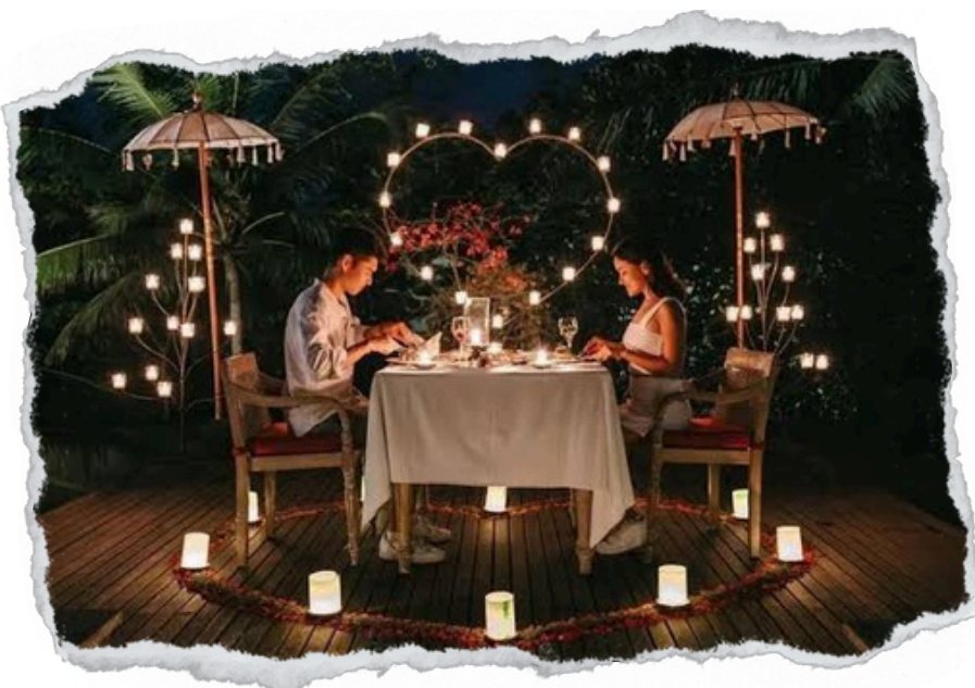
Candle light Dinner